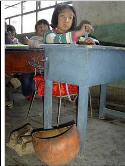
She attends her class