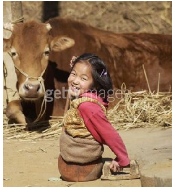
She always smiles